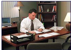
Fully functional offices that are ready now!

Southpointe Suites comes fully furnished and equipped and ready for you to begin working productively from